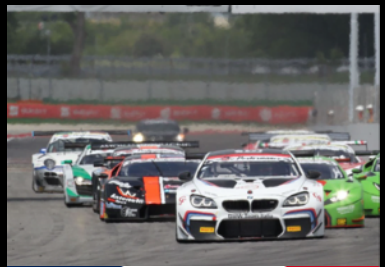
PAUL RICARD JUNE