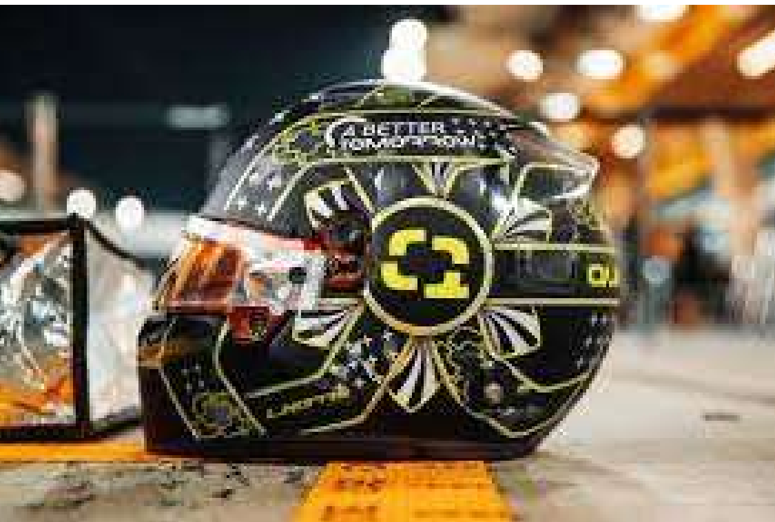
Lando Norris's helmet for quadrant